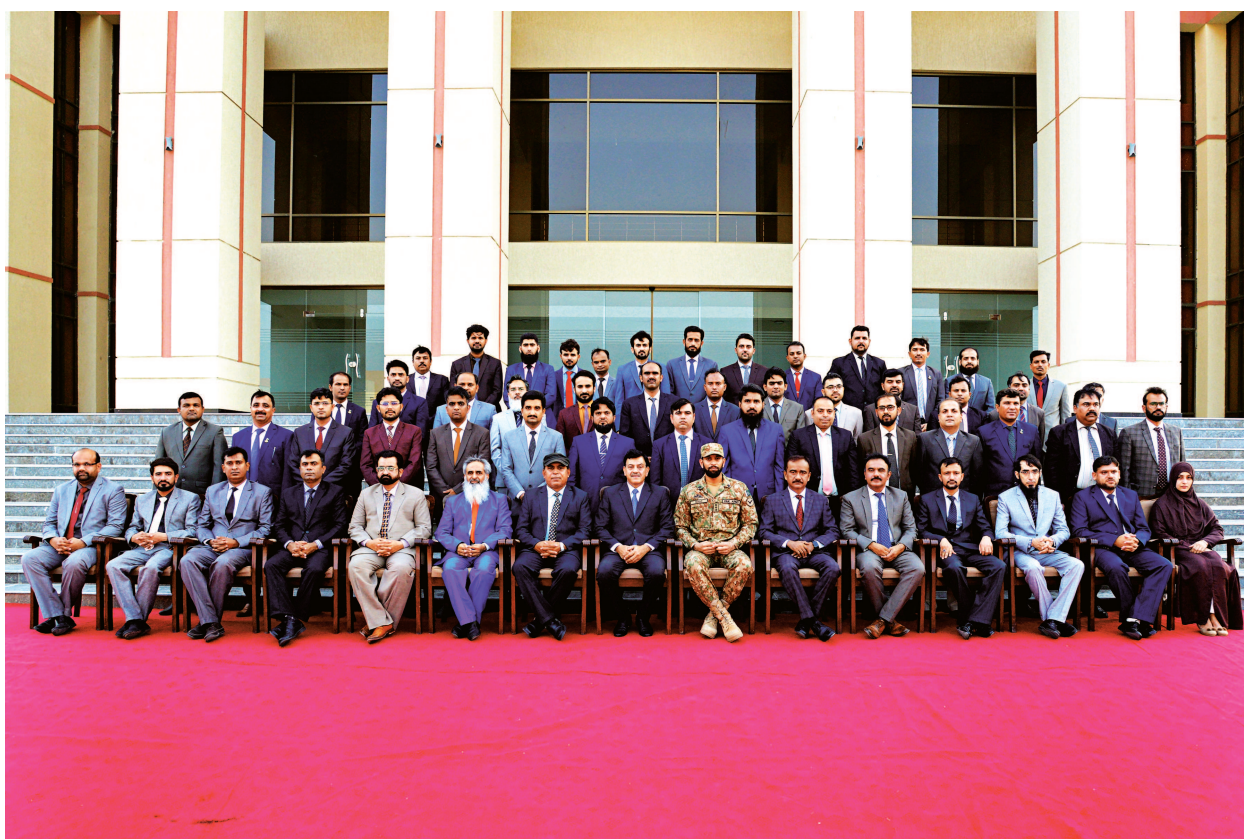
Faculty of Cadet College Larkana